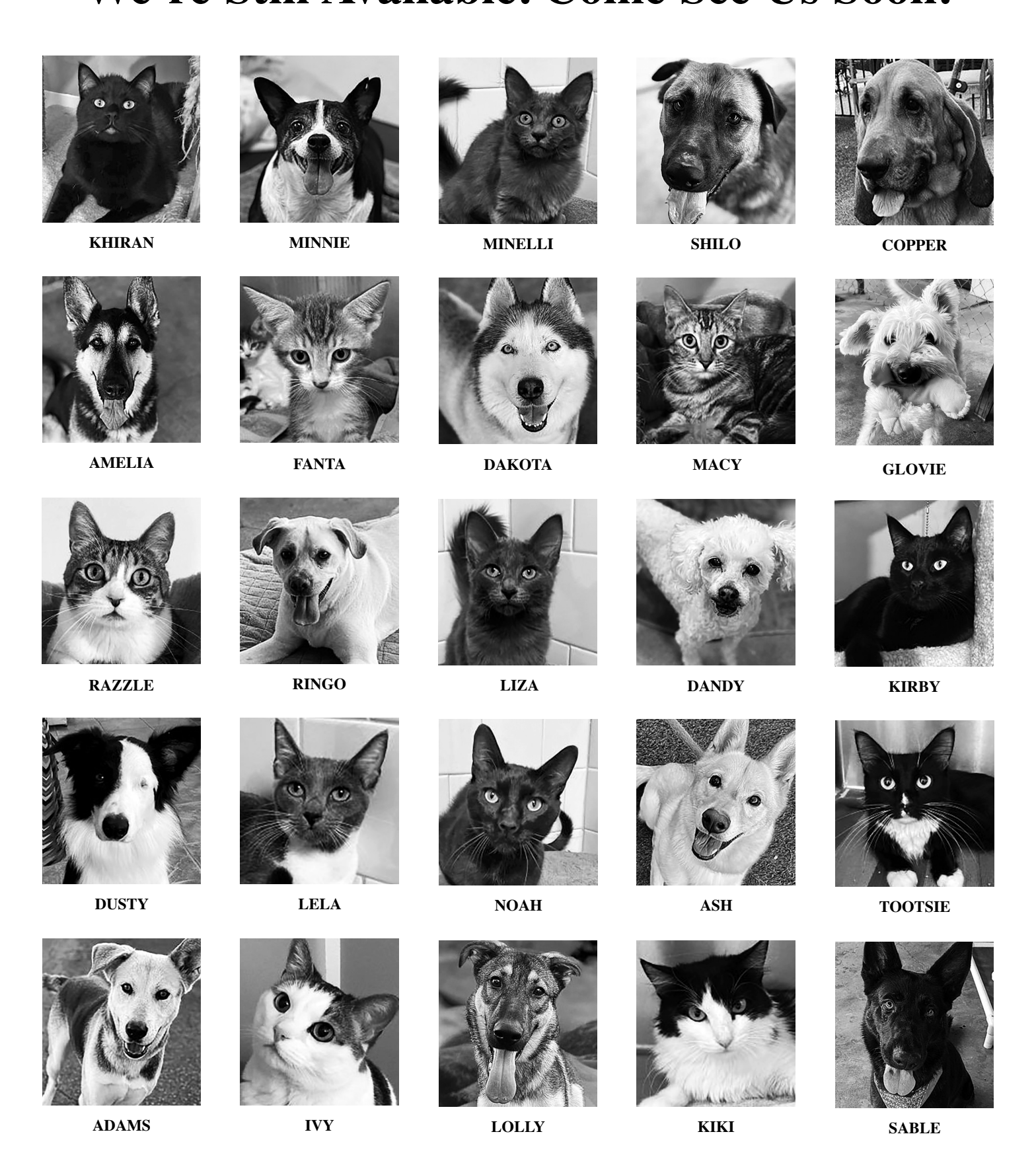
The greatest thing we can say is thank you for your support of Pet Adoption Fund!

We are proud of our shelter and invite you to come by for a visit. Please call or check our website for adoption procedures and hours of operation.